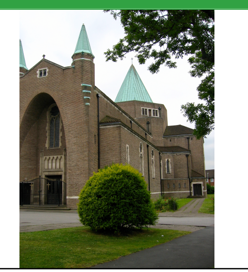
Make sure all the features are captured